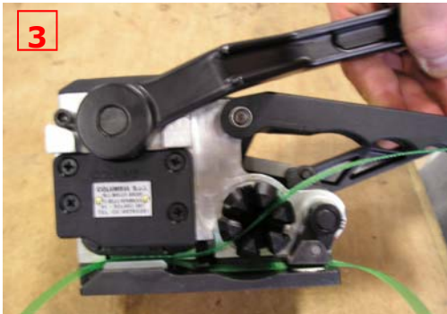
INSERT THE UPPER STRAP