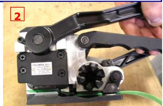
INSERT THE LOWER STRAP