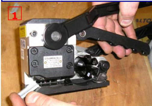
INSERT THE SEAL